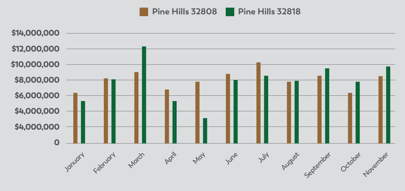
Figure 5: data retrieved from the Orlando Regional Realtor Association Monthly Market Report for December 2020

The volume of home sales in the Pine Hills Community differs somewhat based on what area of the Community the homes are located. The Community is divided, and lies within two zip codes. The housing stock is diverse, and distinct for each zip code. In the 32808 zip code, which is the east side of Pine Hills, the average total home sales reached approximately $8.03 million, but never exceeded $9 million for a single month in 2020. Zip code 32818 however has a lower average of $7.82 million, but has nearly $13 million in sales in the month of March, 2020.