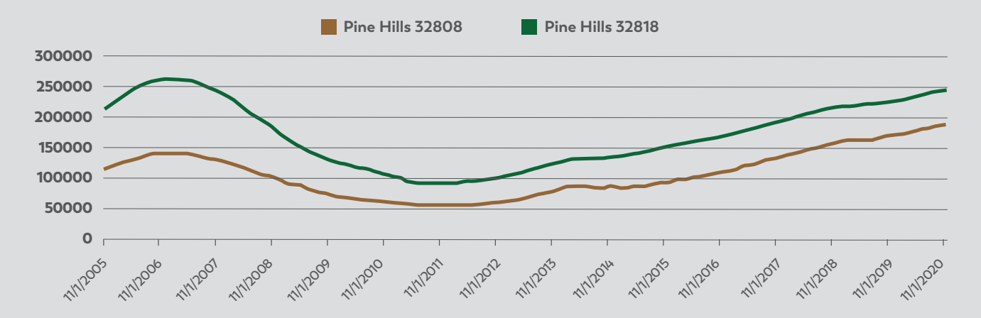
Figure 4: data retrieved from Zillow

Available housing stock , and home sales are a key indicator of a community's economic health. If housing stock is in demand, then it is likely that home prices will be higher. This information, along with the data provided above, is what new companies use to determine whether or not they would like to invest in a community. Like most communities, home sales in Pine Hills declined in 2008, but started to recover in late 2011. Since that time home sales have increased steadily reaching a pre-recession mark in November 2020.